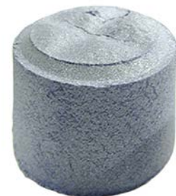
Pre-compacted doses for enhanced compaction efficiency