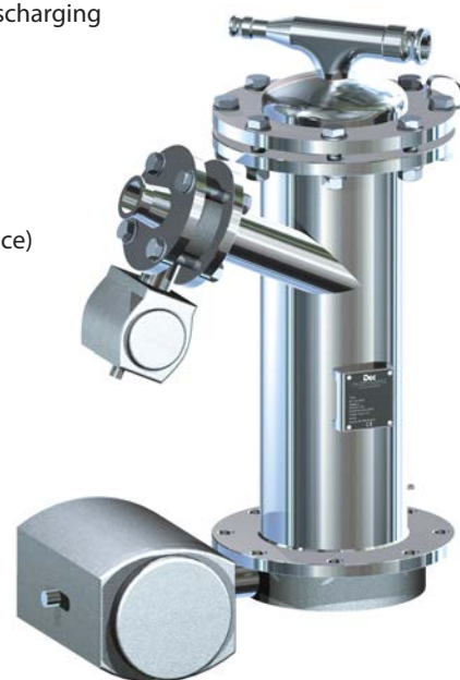
PTS* – Powder Transfer System