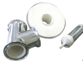
Special inserts for very hard products